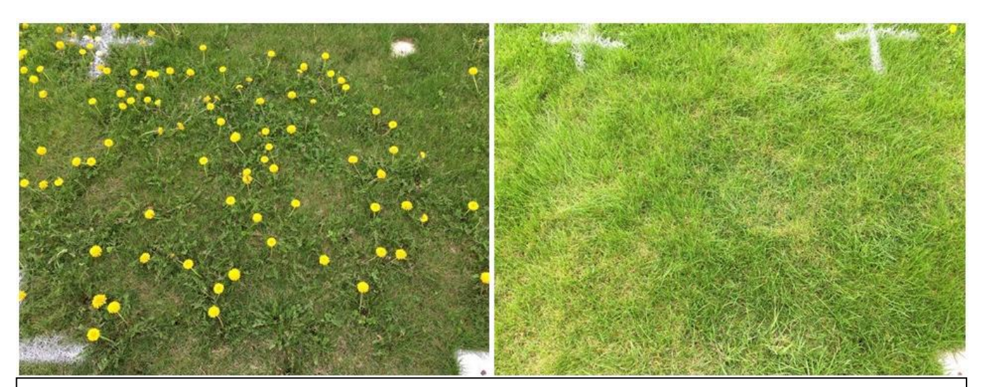
Figure 2 . Effects mowing treatments on the efficacy of a fall application of Trimec Classic in Mead, NE. Left : not treated with herbicide; right : representative of mowing 4 days before to 4 days after treatment with herbicide. Pictures taken 24 April 2017 (28 weeks after treatment).

While this may be surprising, I suspect the lack of reduced control has more to do with the lack of leaf biomass removed from weeds during mowing than it does with the timing of mowing. Only small amounts of dandelion leaves were removed during mowing in this study, meaning the translocation of absorbed herbicide was unaffected. Our results may have been different if we completely defoliated our research plots following treatment. However, I don't think results would have been drastically different at a lower mowing height – as long as weeds aren't scalped, the treated leaf material often remains after mowing turf. Researchers at Purdue recently evaluated the effects of mowing timing on the efficacy of various herbicides on ground ivy, and came to similar conclusions (Beck et al., 2014).